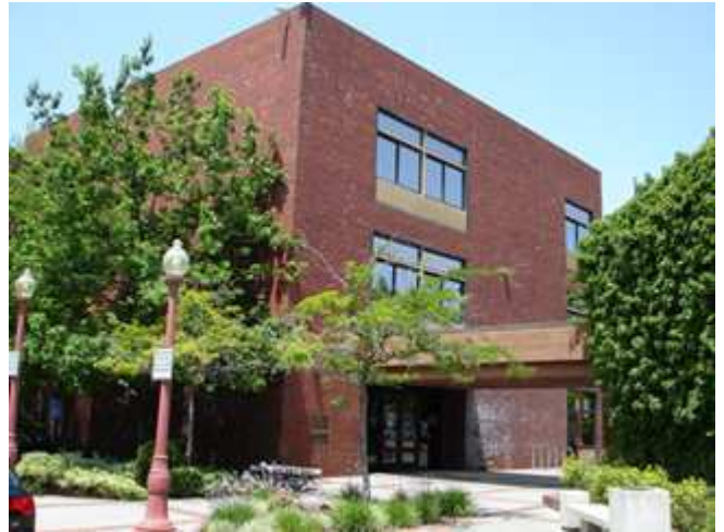
Antioch City Hall